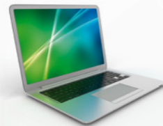
Mac + PC